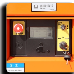
Touch Display Screen