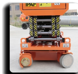
Compact Turning Radius