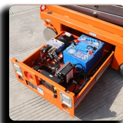
Slide Out Tray